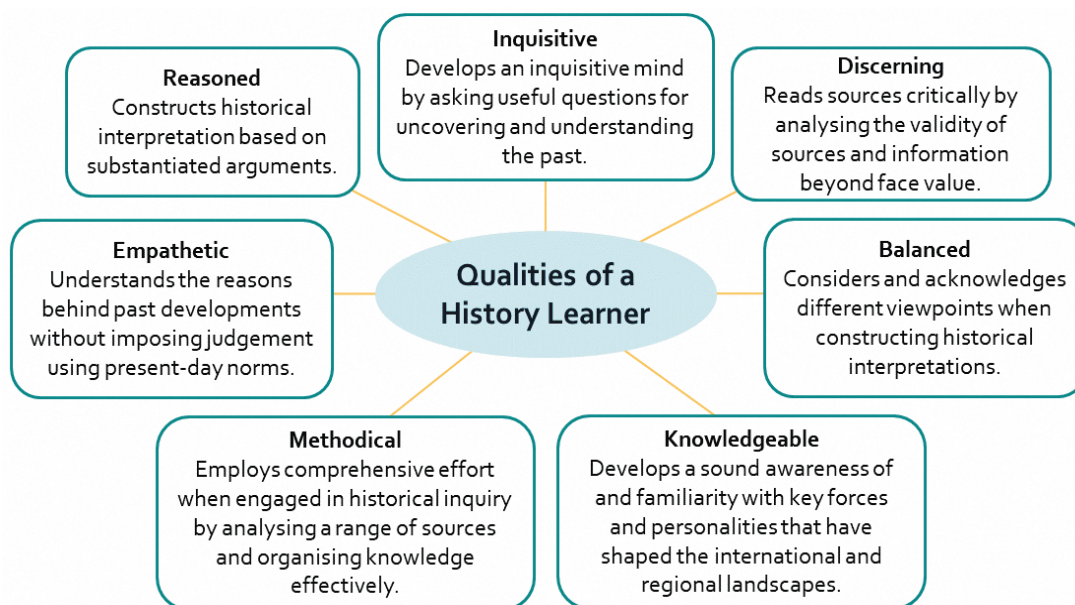
Figure 1. Qualities of a History learner

History prepares students to thrive as citizens in a complex and fast-changing world by equipping them with the knowledge and skills to understand how forces, events and developments of the past shaped today's world. It also develops in students a disciplined and critical mind to discern and make informed judgements based on consideration of multiple perspectives, reasoned and well-substantiated conclusions. History also helps students to participate actively in a globalised world, as they learn to make sense of ambiguous and complex global developments, appreciate local contexts and engage with different cultures and societies sensitively. These are encapsulated in the seven qualities of a history learner which the History curriculum aims to develop: